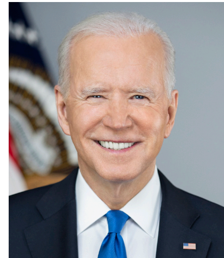
Joe Biden 46th President of the United States

But securing passage of the ARP is only the first step. In many ways, what lies ahead for the administration is even more difficult and will require much more of the president's team. Implementation of the ARP must leverage every dollar of the $1.9 million enacted to carry out the ARP's multiple mandates and to ensure that the relief reaches the most vulnerable and underserved, a key measure of equity. For Latinos, this means investing in a national plan and mobilizing all of the government's resources to remove long-entrenched obstacles that often prevent Hispanic families from accessing the health and economic supports for which they qualify. While the