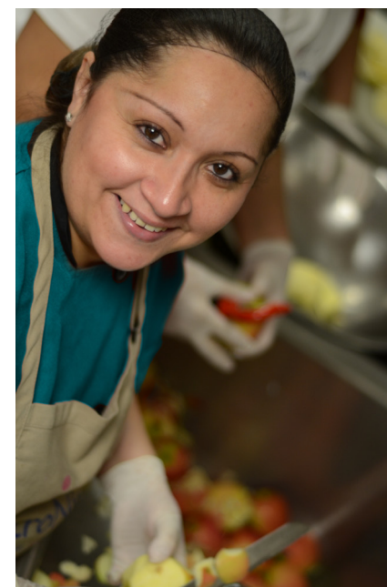
Essential worker preparing food.