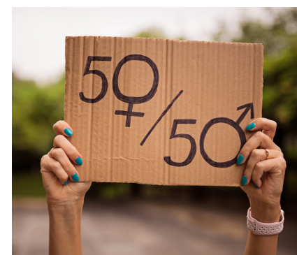
Woman holding a sign highlighting the need for equal pay.