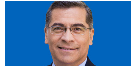
Xavier Becerra Secretary of Health and Human Services