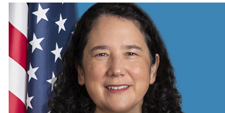
Isabel Guzman Administrator of the Small Business Administration