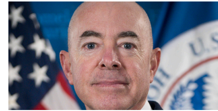
Alejandro Mayorkas Secretary of Homeland Security

UnidosUS supports the "Justice in Policing Act" to bring accountability to law enforcement on matters of racial profiling, police shootings, and the systemic racism that has led to disproportionate involvement in the criminal justice system for Black and brown communities.