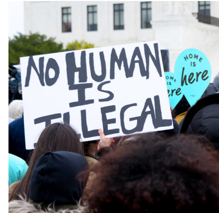
Protestors at a Home is Here: March for DACA & TPS rally in Washington, DC.

UnidosUS commits to continue its advocacy on Capitol Hill and through its nearly 300 Affiliates across the country to fight for 1) ensuring that Latino communities reap the full benefits of the American Rescue Plan, 2) a path to citizenship for essential workers and their families, including DACA and TPS-holders, and 3) an equitable recovery that prioritizes breaking down systemic barriers to wealth-building and raising up those who have been left behind for decades.