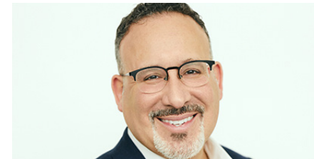
Miguel Cardona Secretary of Education